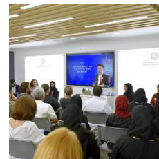
Debate Mate CLOSING PLENARY